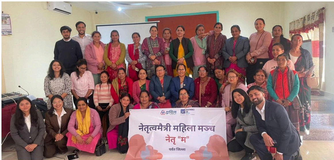
IEN's Women's Network pilot in Kushma, Parbat brought together women leaders to connect, share experiences, and strengthen local political leadership.