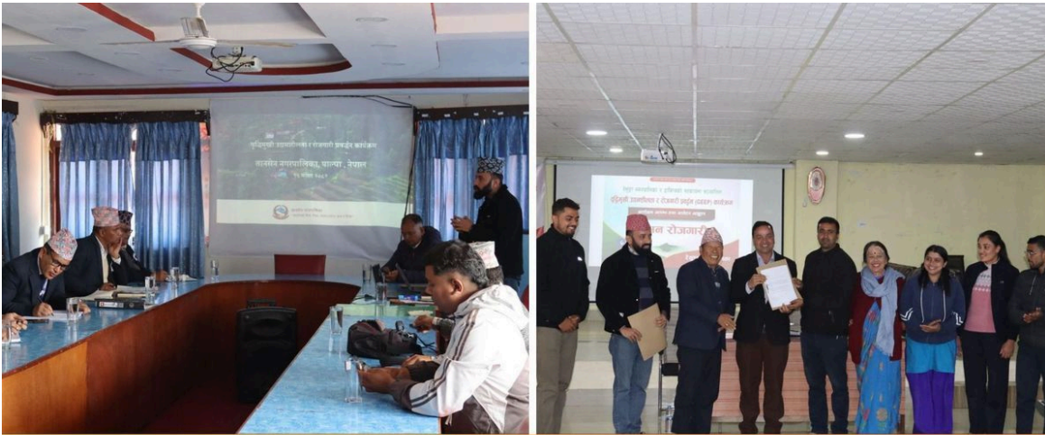
GEEP launched in Tansen and Resunga, strengthening local employment through inclusive rural entrepreneurship for women and youth.

stakeholders, the launch laid a strong foundation for effective and inclusive implementation of GEEP, particularly benefiting women and youth.