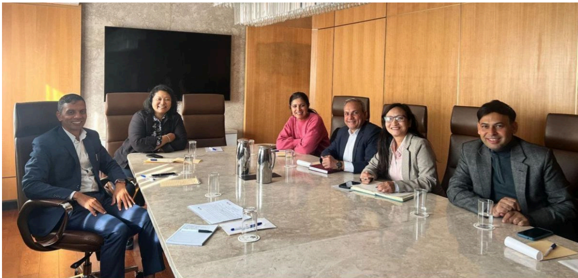
Governance Lab supported the CGIAR CSF consultation and hosted a WEF Nexus lunch, advancing collaboration on sustainable food, land, and water systems in Nepal.

Governance Lab supported the Stakeholder Consultation Workshop on the CGIAR Country Strategy Framework (CSF) in Nepal), held on Monday, 24 November 2025, at Hotel Himalaya, Lalitpur. The workshop brought together diverse stakeholders to discuss the CSF co-design process, priority areas, partnership strategies, and actionable pathways for transforming food, land, and water systems in Nepal.