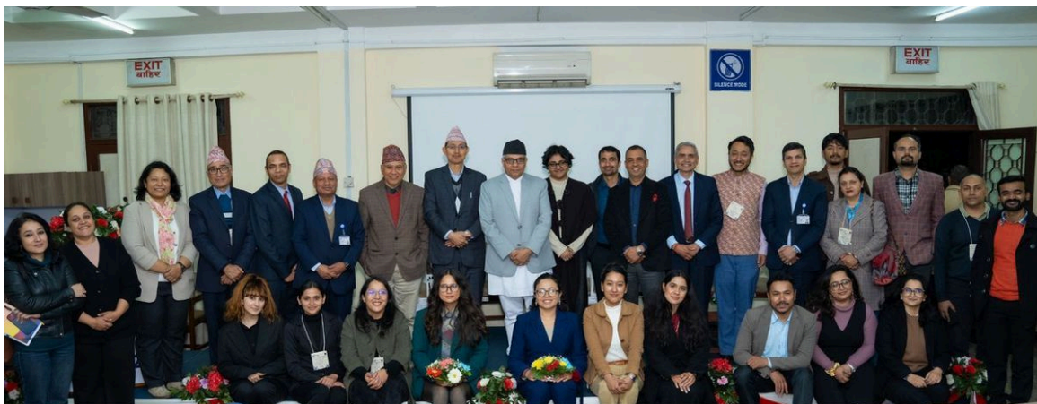
NGS '25 convened diverse voices across government, private sector, youth, and academia to reimagine Nepal's development pathway mobilizing People, Money, Data and Tech for inclusive, enterprising growth.

NGS'25, organized by Governance Lab, in collaboration with Daayitwa was successfully convened on Friday, 12 December 2025, bringing together government officials, private sector leaders, youth, alumni, civil society, and academia to reimagine Nepal's development pathway.