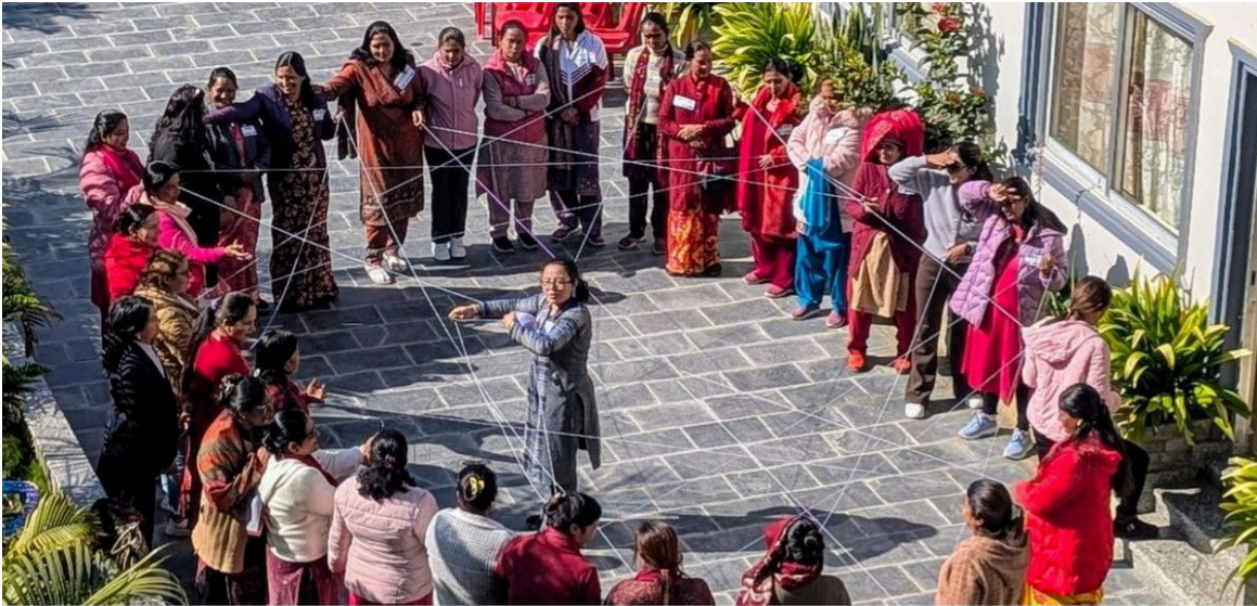
IEN's Women's Network pilot in Kushma, Parbat brought together women leaders to connect, share experiences, and strengthen local political leadership.

IEN held the second Women's Network pilot meeting in Parbat on December 20, 2025, in Kushma, with 32 women leaders and political aspirants in attendance. Participants included women from the original pilot sample, returnees from the first Parbat meeting, and new participants who joined through peer referrals and recommendations.