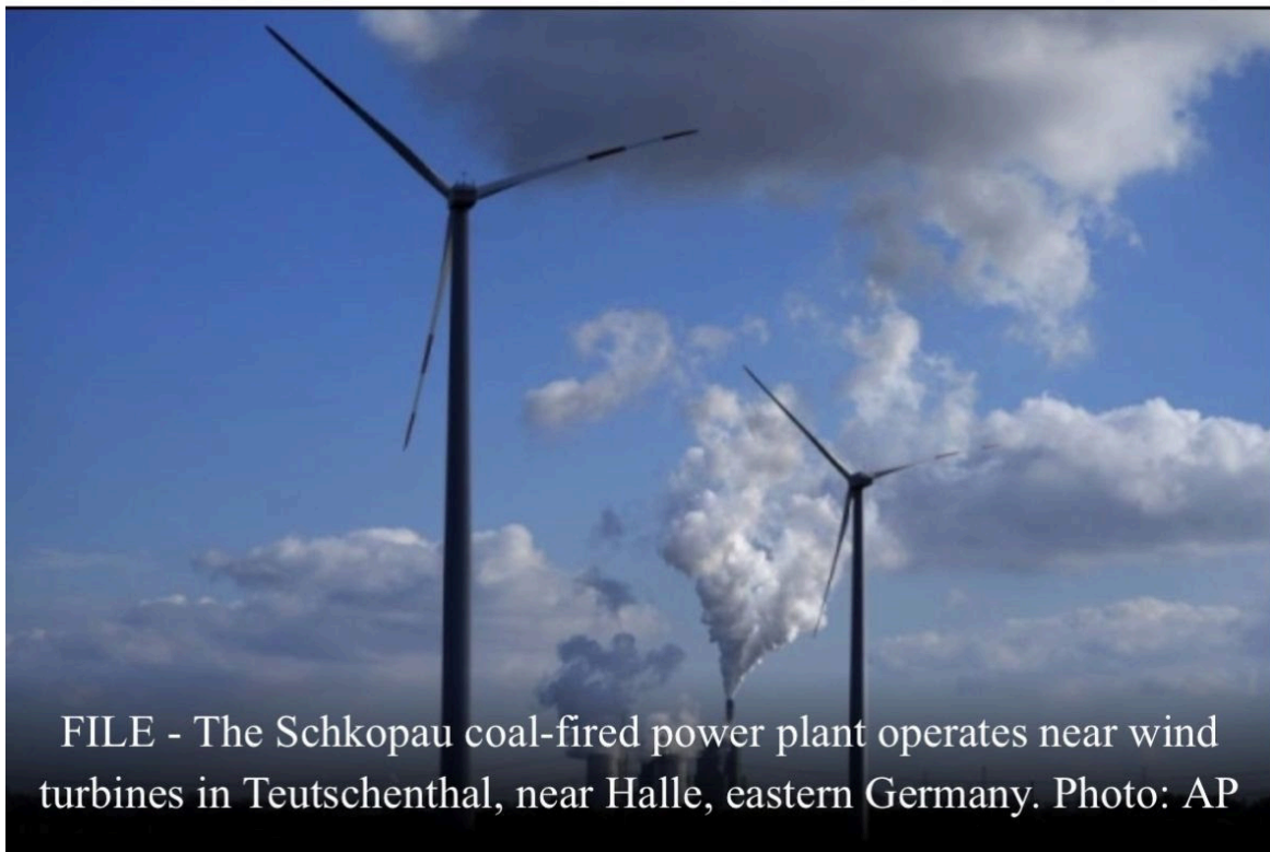
FILE - The Schkopau coal-fired power plant operates near wind turbines in Teutschenthal, near Halle, eastern Germany.

Stay connected to receive these enriching insights directly to your inbox, please subscribe to our newsletter.