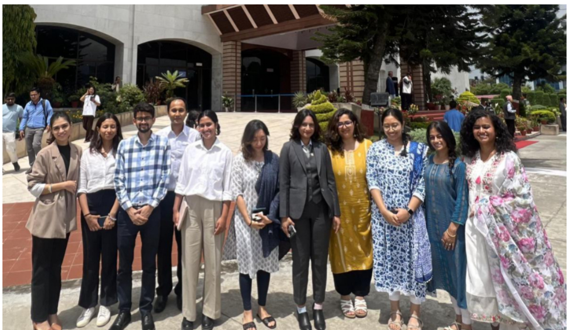
The DNPPF Fellows visited the Parliament House in New Baneshwor on June 28, 2024, for an